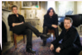
Great Big Sea