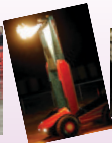
Monster Trucks & Transformers