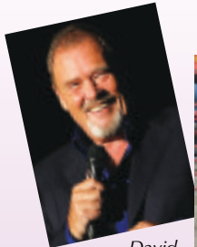
David Clayton Thomas